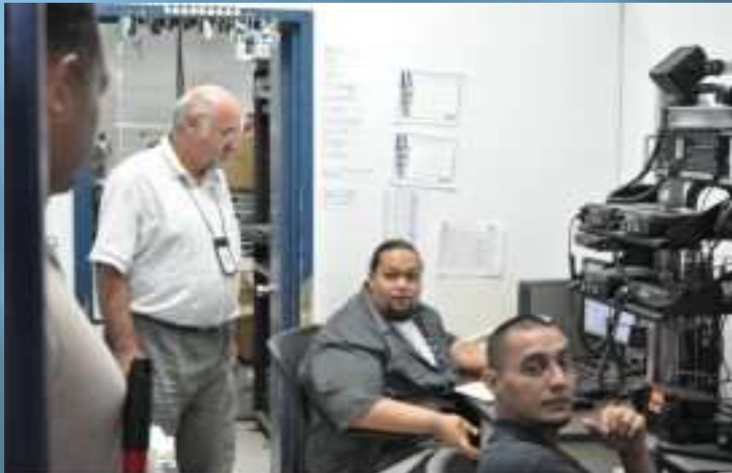
ASDHS-TEMCO's EOC staff manning phones; monitoring hurricane & earthquake reporting, and updating ASDHS-TEMCO on current events